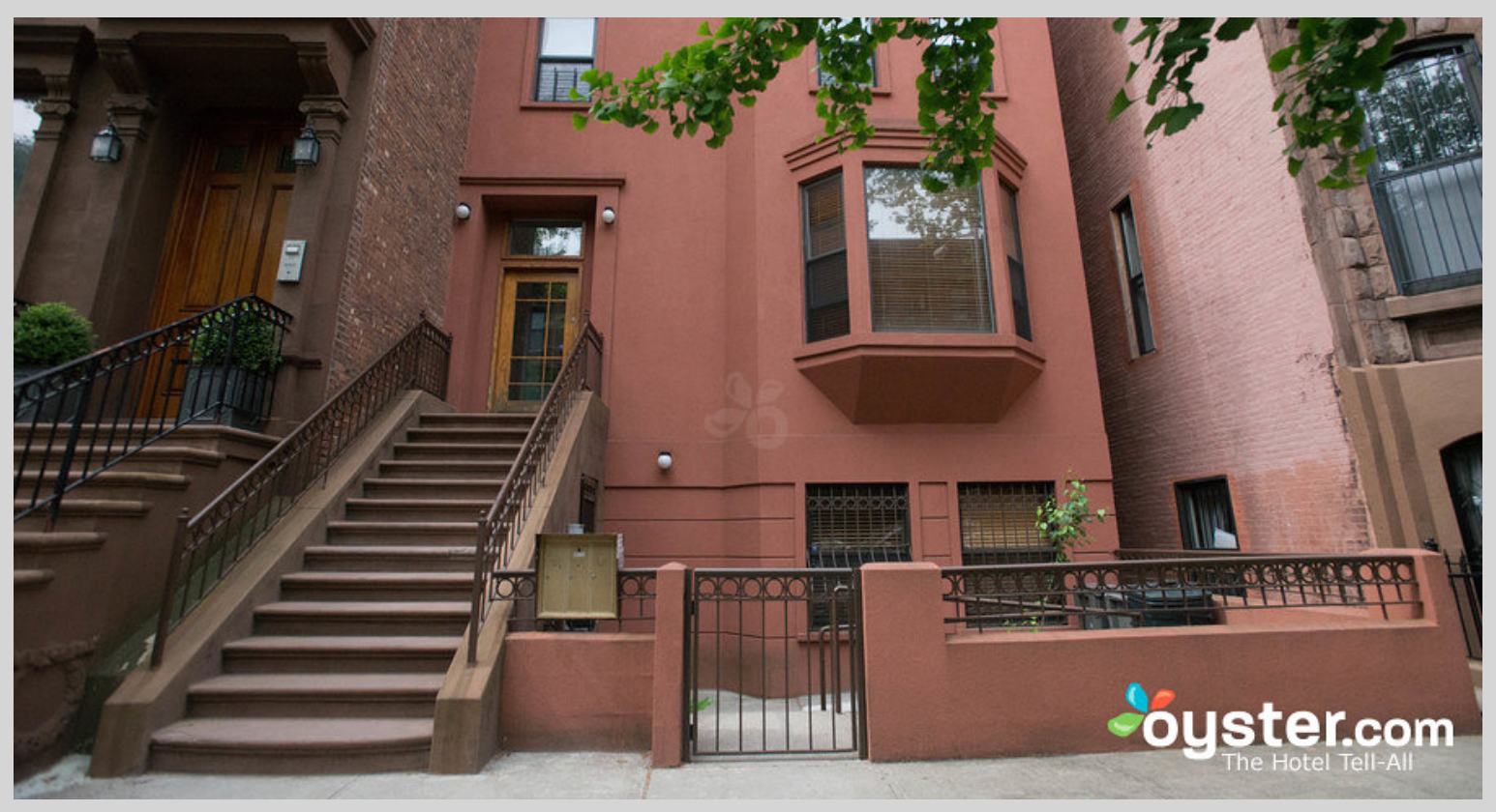
There is Wi-Fi and car park free There only take cash